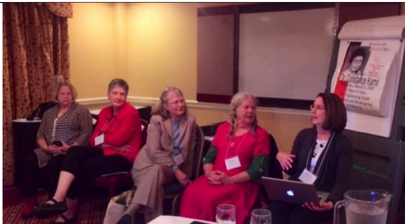
Panel Discussion in Charleston